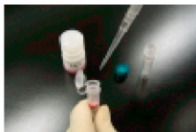
Step 4. Add 100 µl Washing buffer to the reaction solution, and transfer the solution to Filtration tube