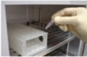
Step 6: Rinse the entire surface of the membrane with the solution by pipetting, and incubate the tube at 37°C for 2 hours.