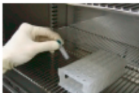
Step 1-3. Prepare 2 mM amine compound solution with Reaction buffer, and mix it with NH2reactive peroxidase. Pipette several times, and incubate at 37 °C for 1 hr.

d) The peroxidase-labeled small molecule should be stable for at least 6 months at 0-5 °C.