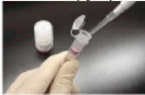
Step 1: Add the sample solution containing 50- 200 µg IgG and 100 µl Washing buffer to Filtration tube.

c) The concentration of the conjugate is 0.5-1.3 mg/ml. Dilute the peroxidase-labeled IgG to prepare a solution with an appropriate concentration prior to using it for enzyme immunoassay, immunoblotting or immunostaining. One to three molecules of peroxidase should be introduced onto one IgG molecule. Unconjugated peroxidase should not interfere with normal immunoassays. If purification is necessary, use a gel permeation column or an