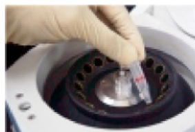
Step 5-8. Centrifuge at 8000 g for 10 min. Discard the filtrate, add 200 µl Washing buffer to the tube, and centrifuge (Repeat this procedure once more)