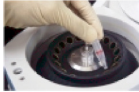
Step 7: Centrifuge at 8000 g for 10 min