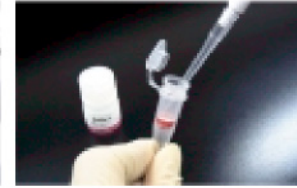
Step 8: Add 200 µl Storage buffer, pipette to recover the conjugate. Transfer the solution to 500µl tube, and store the solution at 0-5°C.