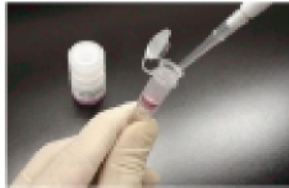
Step 7: Add 100 µl Washing buffer to the tube