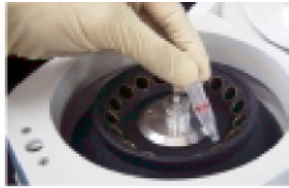
Step 2-3: Centrifuge at 800 g for 10 min. Add 100 µl Washing buffer, and centrifuge once more