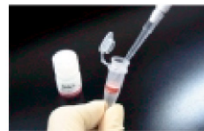
Step 9-10. Add 200 µl Storage buffer, and pipette several times to dissolve the conjugate. Transfer the solution to a 500 µl tube, and store the solution at 0-5°C.

For any question, contact your local distributor